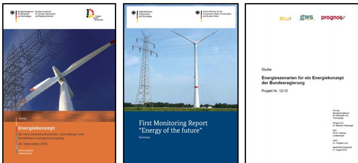
Figure 1. Cover pages of the brochures discussed in this text (from left to right): energy concept (FMET 2010), English summary of the first monitoring report (FMET & FME 2012), energy scenarios (Prognos AG & EWI & GWS 2010).

With this concept – being a direct implementation of the EU 2020 climate and energy package enacted in 2009 – Germany became one of the global pioneers in establishing a sustainable energy economy. Not surprisingly, this political bravura performance had been thoroughly prepared in advance. Among other things, a group of experts had been commissioned to model data-driven energy scenarios (documented in a 267-page brochure of the same title) in order to assess the consequences of possible political decisions.