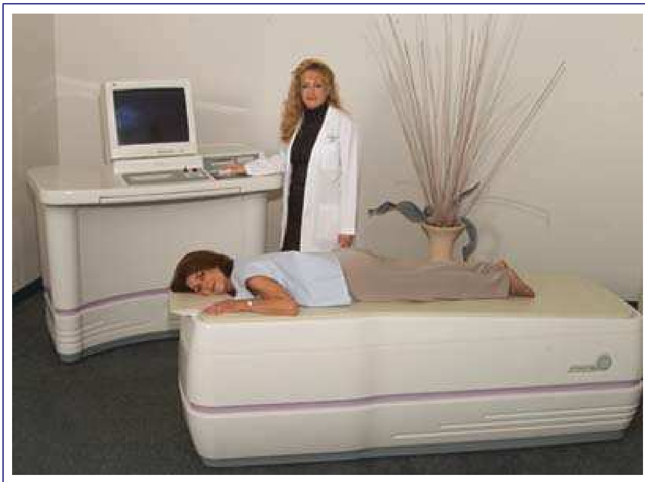
Figure 1 from Gibson, Hebden and Arridge (Phys. Med. Biol. 50, R1–R43, 2005) Imaging Diagnostic System Inc.'s computed tomography laser breast imaging system. See www.imds.com for more details.